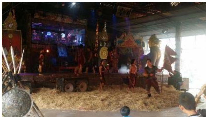
Figure 4 A performance about King Naresuan who fought for Ayutthaya's independence