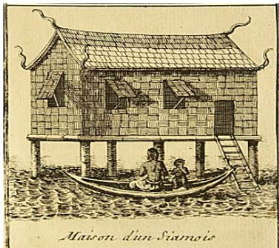
Figure 2 House in Ayutthaya kingdom

“The retention of the authenticity of heritage places and collections is important. It is an essential element of their cultural significance, as expressed in the physical material, collected memory and intangible traditions that remain from the past. Programmes should present and interpret the authenticity of places and cultural experiences to enhance the appreciation and understanding of that cultural heritage”