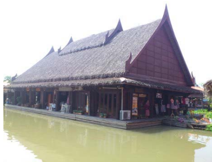
Figure 3 A building in Ayothaya floating market

Source: http://camillesourget.com/en/rare-books-loubere-thailand/ . Simon de La Loubère.