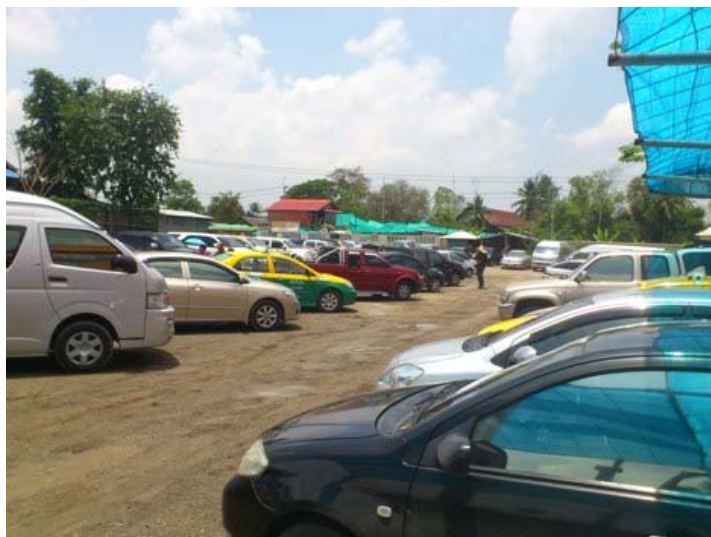
Figure 7 A car park at the floating market

It is also shown in the map that there is a large car park for personal vehicles in front of the entrance to the market (8,000 square meters) and for tourist coaches on the left side of the market (see figure 7). Both car parks have space for a maximum of 500 personal vehicles and 50 coaches. Both car park services are free of charge. From this information, it is possible to estimate the carry capacity of 4,000 tourists a day (one personal car has on average 4 persons and one tourist coach has 40 persons). Moreover, there are many private parking areas organized by local inhabitants nearby. The fee is reasonable (30 Baht per car with no limitation of parking hours). However, the number of tourists might not reach that figure on weekdays. In contrast, the number of tourists is large at weekends and holidays.