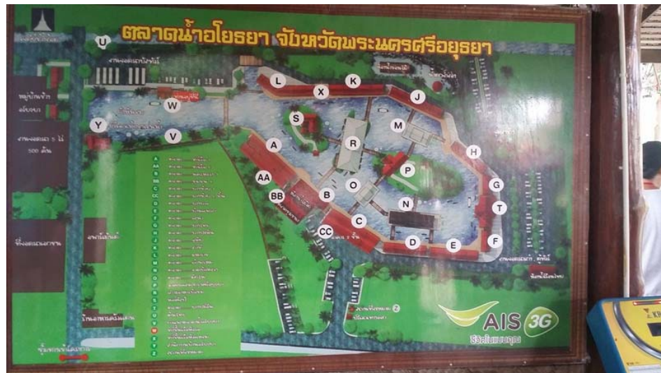
Figure 5 Ayothaya floating market map

Zoning in the market is arranged as follows;