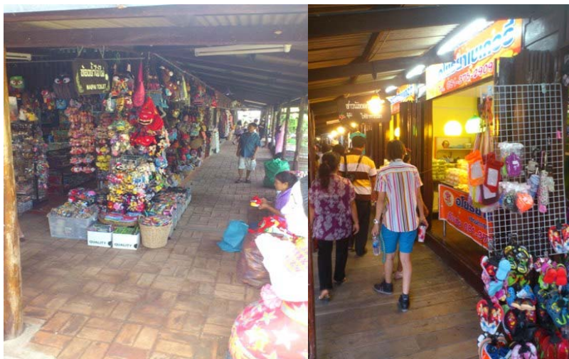
Figure 8 Shops in the market

The potential problem to tourism that is related to the two aforementioned impacts is the loss of interest in Ayothaya floating market. It is because it cannot preserve and present the “authenticity” of cultural heritage properly. Tourists who seek ‘something different’ will later realize that what they found at Ayothaya floating market, can easily be found at Chatujak weekend market or at another floating market in Thailand (see figure 8). When the number of tourists decreases, it means the income and benefits will be also reduced and it will negatively affect the local economy.