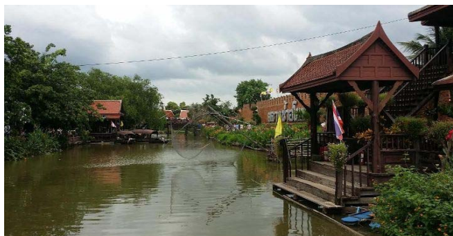
Figure 1 Ayothaya Floating Market

Ayothaya floating market is situated outside Ayutthaya Island and is far from the three main rivers. It is located in a large artificial pond that was constructed to host the floating market. This helps formulate a realistic element of the market, Talad Nam as well as to stimulate visitors’ sense of authenticity (see figure 1).